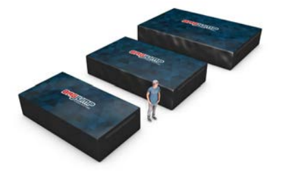
AIRPIT GYMNASTICS The portable pit for gym training.